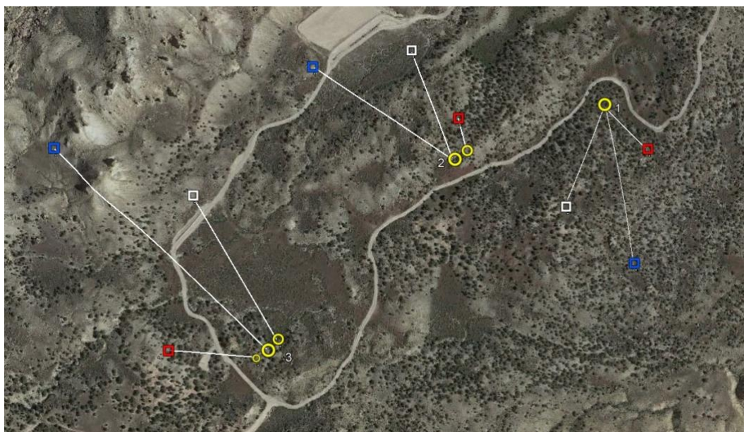
This diagram illustrates three possible shooting area scenarios and their associated target engagement based on the target indicator orientation. There is a single area from which all three targets are indicated to be engaged, a stage with an indicator for the white and blue target, with a separate area indicated for the red target, and finally a stage with separately indicated areas for each individual target.